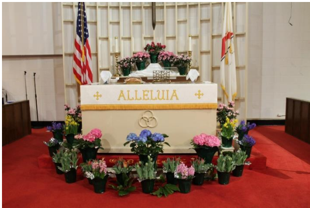
Easter Flowers from Countryside Gardens