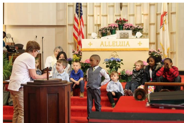
The children gather around to hear the Easter story.